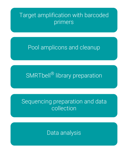
Figure 1. General steps of HiFi targeted sequencing

Here, we present general instructions for coamplification of full-length CYP21A2 and CYP21A1P genes from human genomic DNA (gDNA) samples using barcoded primers in a single round of PCR, as shown in Figure 1. The recommended input gDNA per sample is 50 ng. Typical amplicon sizes for CYP21A2 and CYP21A1P are 10.1 kb and 8.9 kb, respectively, enabling a better SV and breakpoint detection (Tantirukdham et al., 2022).